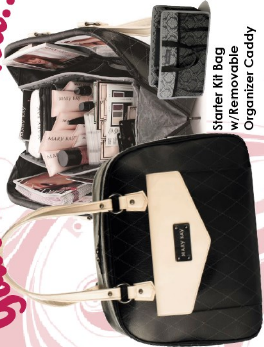
Starter Kit Bag w/Removable Organizer Caddy